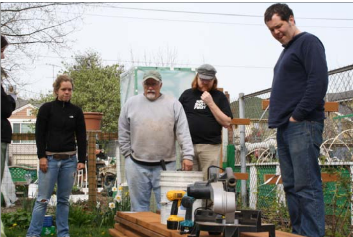
Seattle Works volunteers made progress on several spring projects, including building raised garden boxes for our seniors to use at their homes. Mil gracias!