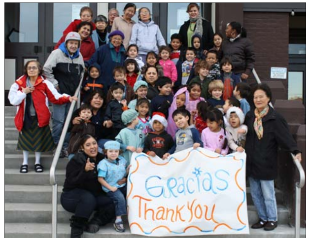
Gracias to United Way, Mortenson Construction, Architects W/O Borders, Engineers W/O Borders, and McKinstry for the brand new concrete stairs! When completed, the project will save El Centro de la Raza over $180,000!

... Through a project organized by United Way, new stairs are being built for the North, South, and West entrances. Mil gracias to Mortenson Construction, Architects W/O Borders, Engineers W/O Borders, and McKinstry for their generous pro-bono efforts. The project will save El Centro de la Raza over $180,000 in necessary repairs.