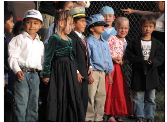
Over 50 children in our early learning program celebrated moving on to kindergarten at the graduation ceremony organized by parents and teachers in August.

Additional services: Child Literacy and Family Education