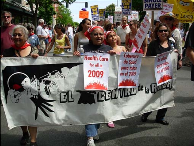
El Centro de la Raza joined more than 150 organizations that organized the May 30th “Health Care for All in 2009 - Mothers Leading the Way” march and rally in Seattle to support the goal of winning quality, affordable health care for all.