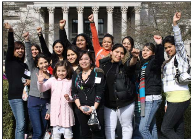
El Centro de la Raza organized a delegation of over 50 participants including youth from Ballard, Chief Sealth and Garfield High Schools, along with students from Denny Middle School to attend Latina/o Legislative Day.

... Save the date for our 2010 Annual Auction Banquet on Saturday, September 25th!