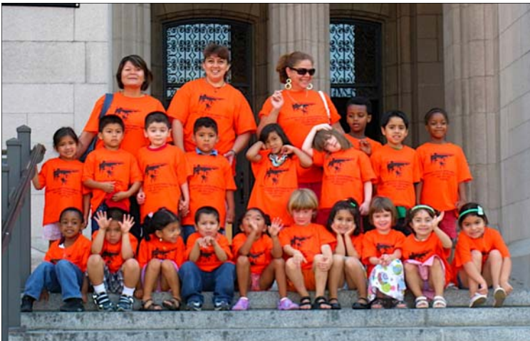
Students in the child development center visited the University of Washington in the summer to tour the campus, meet faculty, and gain exposure to higher education.