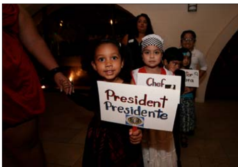
Students give us a career lesson at the auction!

... Over $140,000 raised at our 2009 Annual Auction Banquet! Gracias to everyone who helped make the auction a success!