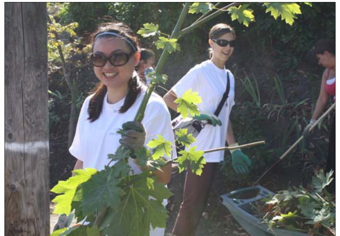
Thirty-two volunteers from Nordstrom helped with spring cleaning and landscaping projects during the United Way Day of Caring in September. Gracias to Nordstrom and their staff!