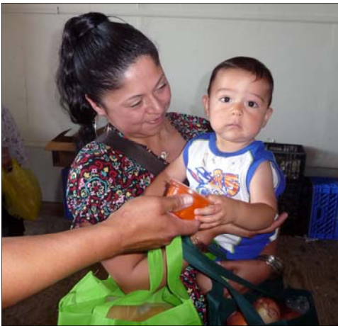
In 2009, 311,464 pounds of food were distributed and over 1,300 unduplicated households were served by our Food Bank.

Additional services: Child Literacy and Family Education