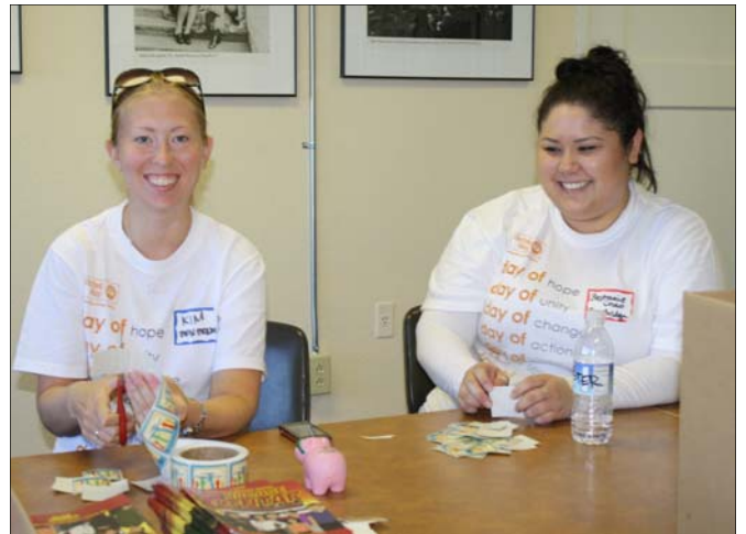
Ten volunteers from Ben Bridge Jewelers who helped prepare for our annual auction banquet during the United Way Day of Caring. Gracias to Ben Bridge and all the volunteers helped out with projects!