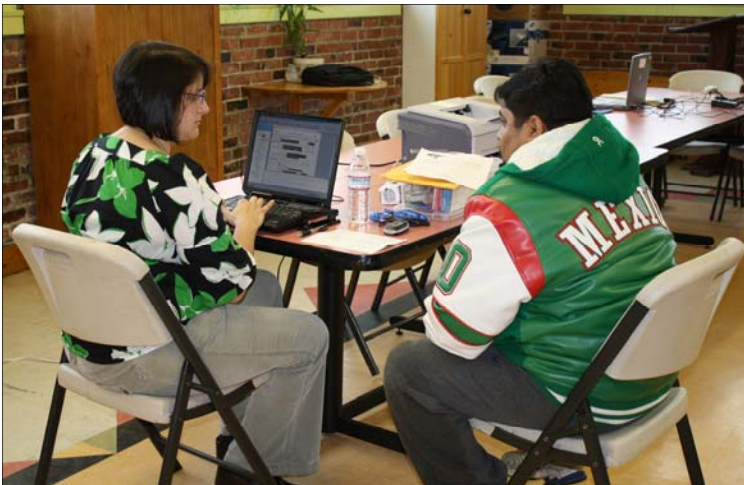
Volunteers filed over 480 returns with $578,650 in refunds during the United Way Free Tax Prep Campaign at El Centro's site between January-April. 25 bilingual volunteers worked for over 3,372 hours to help participants successfully prepare and file their taxes.