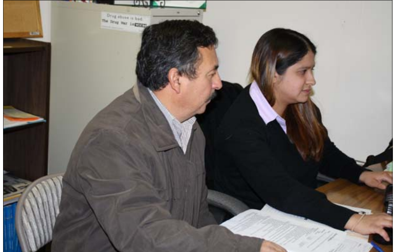
El Centro received funding through the American Recovery and Reinvestment Act (ARRA) for its employment, financial literacy, college readiness and crisis advocacy programs.