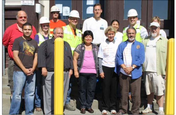
Through a project organized by United Way, new stairs are being built for the North, South, and West entrances of the El Centro building. Mil gracias to Mortenson Construction, Architects W/O Borders, Engineers W/O Borders, and McKinstry for their generous pro-bono efforts. The project will save El Centro de la Raza over $180,000 in necessary repairs.

Some highlights from this year include the 103 volunteers who spent the day with El Centro for United Way Day of Caring for a total of 767 hours. They worked on preparations for both our Annual Auction Banquet and our Día de los Muertos Celebration as well as landscaping, archiving, and cleaning out closets! Volunteers from Ben Bridge Jewelers, Costco, Microsoft, Nordstrom, PACE Engineering, Peace Health, United Way of King County, and Governor Christine Gregoire and Lieutenant Governor Brad Owen joined staff for the wonderful day of service! The Governor and all our generous volunteers were presented with small tokens of appreciation during a lunch ceremony compliments of the Muckleshoot Tribe.