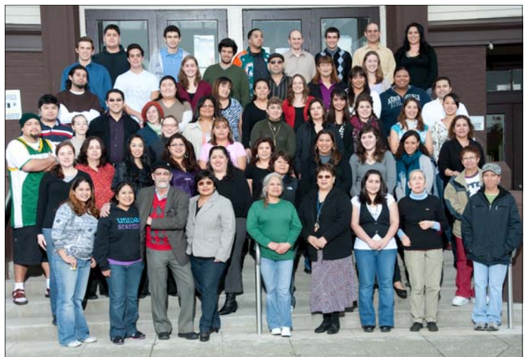
El Centro de la Raza partial staff photo.

University of Washington/Tulalip Tribe, Attorney Current term: 12/2006-12/2012