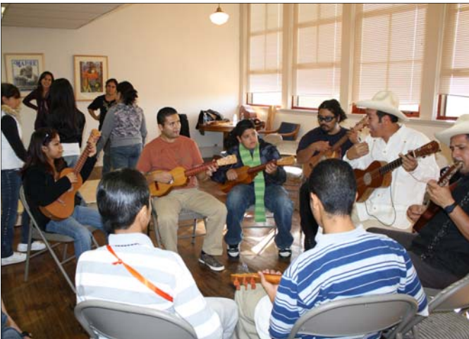
The Seattle Fandango Project and the Veracruz-based band Son de Madera held bi-weekly musical workshops with youth ages 11-17 in the fall. Workshops included instruction on traditional instruments, singing, and zapateado dance.